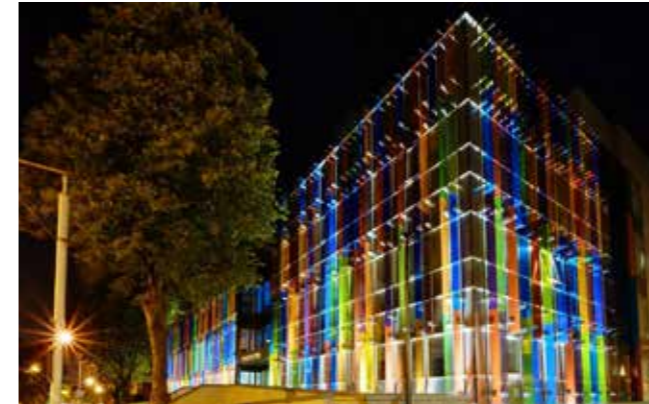
Computer Science Building

The Institute for Global Food Security plays a major role in delivering safe, sustainable and authentic food to the world's population, and has become globally recognised for its excellence in research.