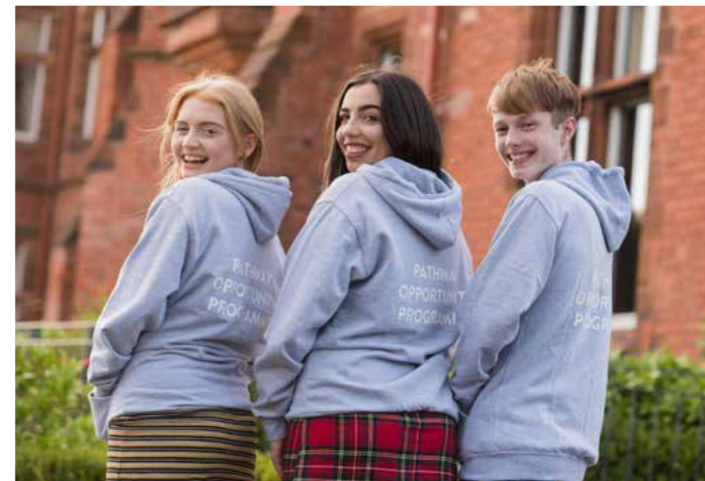
Pathway Opportunity Programme students

The easiest way to update an existing will is through a codicil document. A template codicil is inserted in the back sleeve of this brochure.